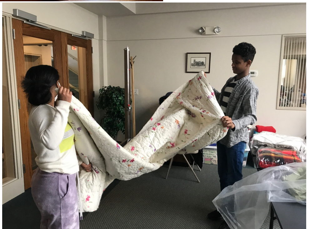
Confirmation Class students fold comforters and help sort donated items.