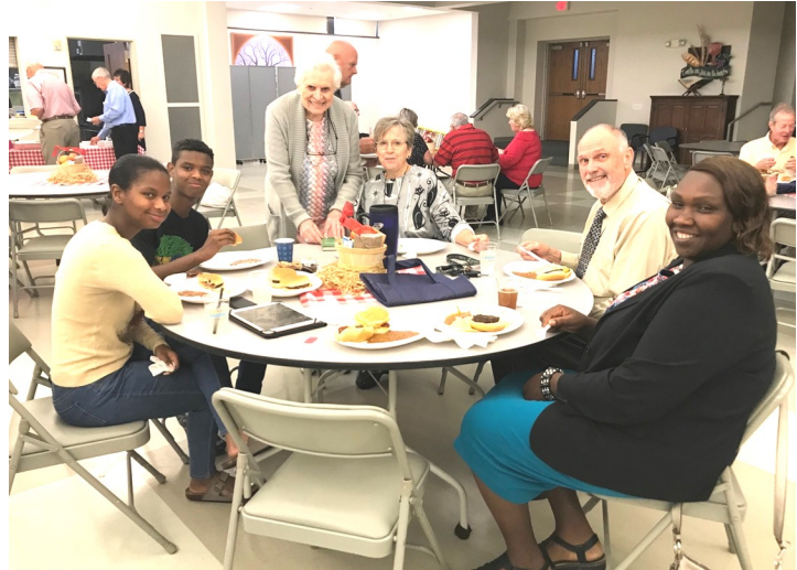
Judging by the smiles, the food and fellowship were good!