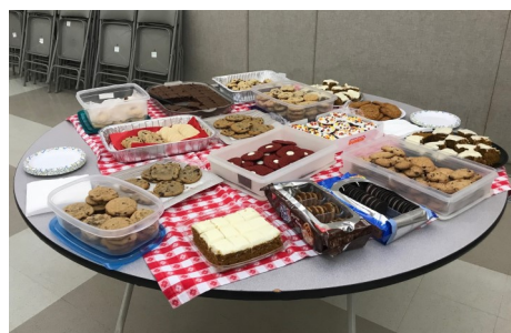
Ask and ye shall receive. Folks kicked in with cookies and bars for dessert.