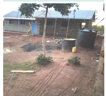
Second classroom under construction.