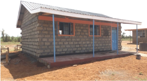
Newly constructed school.