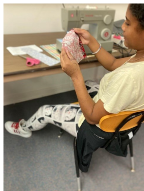
Beacon of Light youth learn to sew in Westminster's sewing room and begin making gift bags.