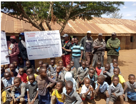
Town kids celebrate with big checks.

A Prayer: Heavenly Father, loving our neighbors means caring for people near or far away. May these gifts of animals help to remind us that in serving others, we are serving you. Amen.