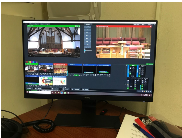
All cameras and graphics are monitored and switched via computer. The computer also streams to YouTube.