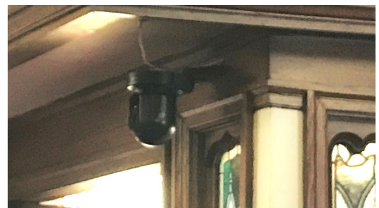
Cameras-three total-powered over ethernet rest beneath the ledge just below the balcony. They are controlled remotely.