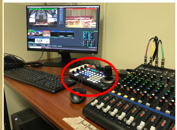
This controller allows the operator to change camera angles, zoom in or out and even focus or adjust the iris.